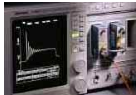
CD Laser Relaxation Oscillation with SD-43.

* 6 Reference Receiver Performance (Opt. RR) 25° ±5°C.